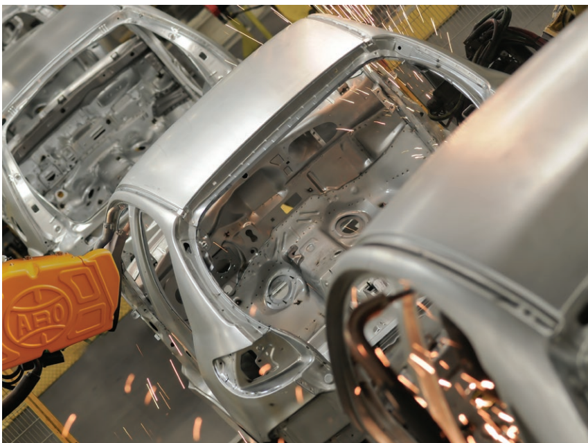
ARO applications support a wide range of industries.

Resistance Welding: simple, robust, cost-efficient