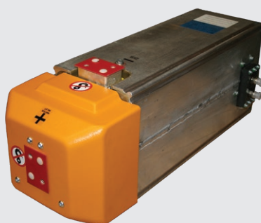
MFDC transformer 360KVA – 80kA.