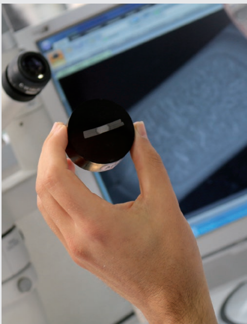
ARO Welding Laboratory.

ARO employ the latest generation of 3D design and modeling tools for every new welding solution. A dedicated engineer oversees each project from inception to completion.