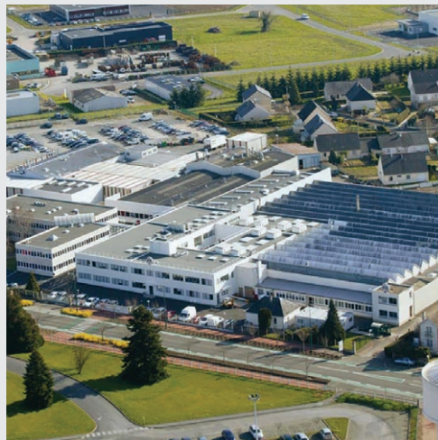
ARO headquarters Montval-sur-Loir, France.