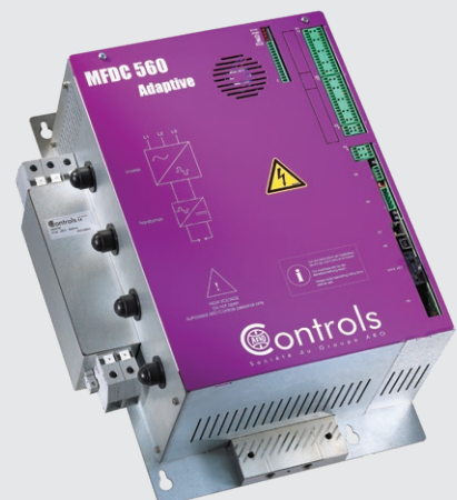
Adaptive Weld Controller.