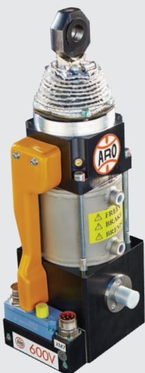
Servo-actuator with integrated force sensor.